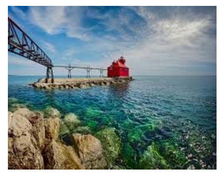
Lighthouse Along the Route

Experience the natural beauty of this premier Great Lakes resort destination