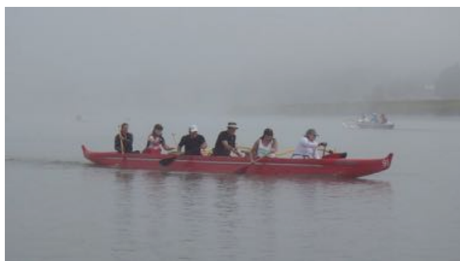
He'e Nalu keeping their cool as they chase Tamalpais OCC