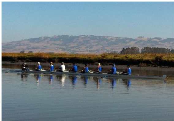
Everyone can play!