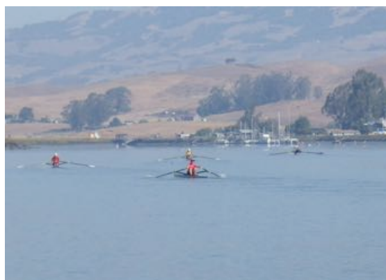
Homeward bound under the protection of Sonoma Mountain