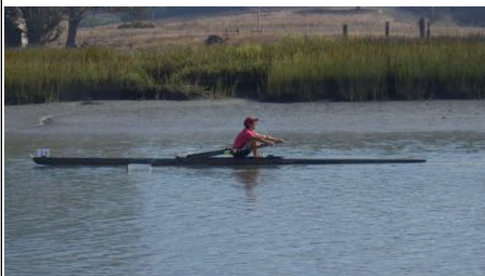
Seven miles into the race and still fabulous conditions