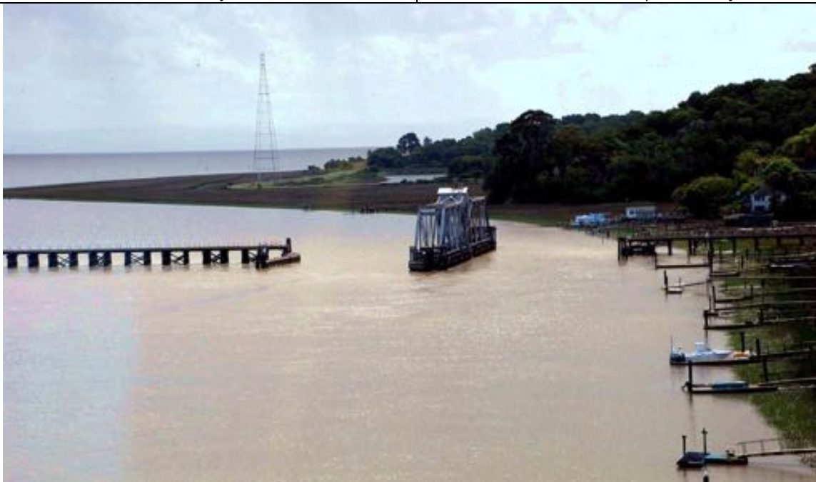
Are you REALLY ready? Make your mark by rounding this historic bridge, 13.1 miles downstream