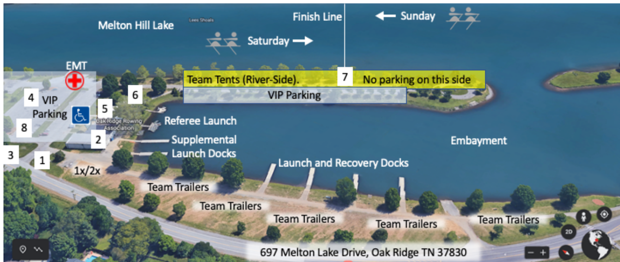
Oak Ridge Rowing Association – Venue Map, 2022 Secret City Head Race