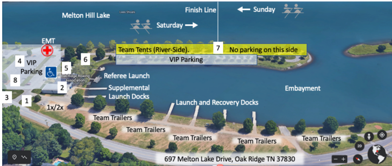
Oak Ridge Rowing Association – Venue Map, 2022 Secret City Head Race