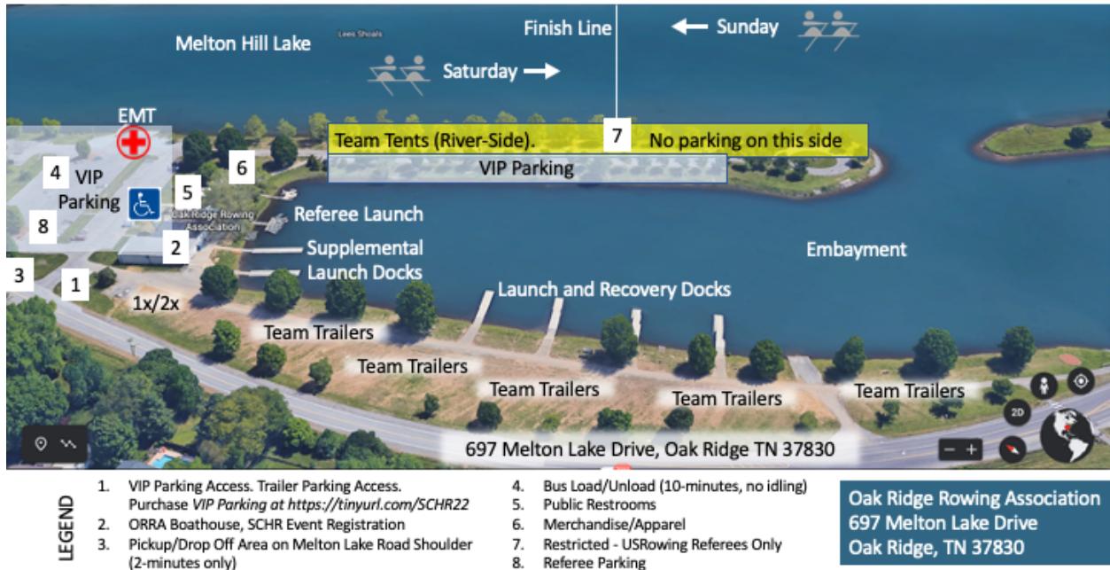
Oak Ridge Rowing Association – Venue Map, 2022 Secret City Head Race

Oak Ridge Rowing Association is located at 697 Melton Lake Drive, Oak Ridge TN 37830. Download a PDF of the Oak Ridge Rowing / Secret City Head Race Site Map here.